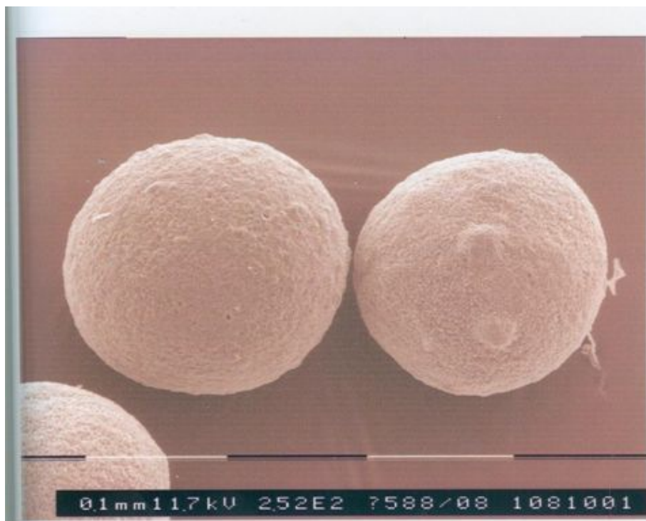
Figure 1 Surface morphology of floating microspheres by scanning electron microscopy

solubility of ranitidine in water which facilitates the diffusion of a part of entrapped drug to surrounding medium during preparation of floating microspheres. The drug entrapment efficiency of different batches of floating microspheres was found to about 85.03 % w/w, results are given in Table 2 . Among the different polymer-drug ratios investigated, 1:6 polymer-drug ratio had the optimum capacity for drug encapsulation.